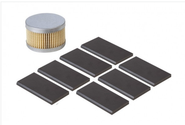
VST EVE-TR-16 Part no. 10.03.01.00133 Set of parts subject to wear pump for: Pump EVE-TR Size: 16 contains: Brush slide kit and: Filter