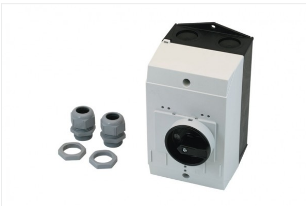
MSS-K 1.6-2.5A Part no. 10.04.04.00119 Motor-protection switch with housing Current range: 1.6 ... 2.5 A Actuation: Rotary switch Colour: grey Protection: IP 65