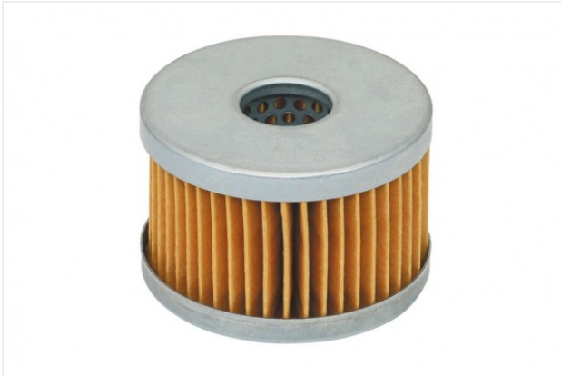
FILT-EINS EVE-16-25 Part no. 10.03.01.00022 Filter insert (round) for: Pump Size: 16-25