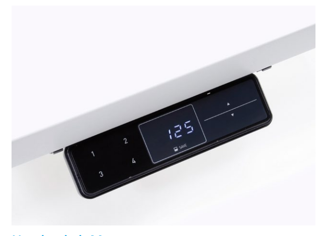
Hand switch Memory TOUCHfx