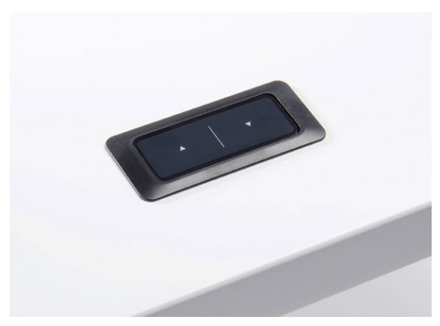
Hand switch Up-Down, Inlay TOUCHbasic IL