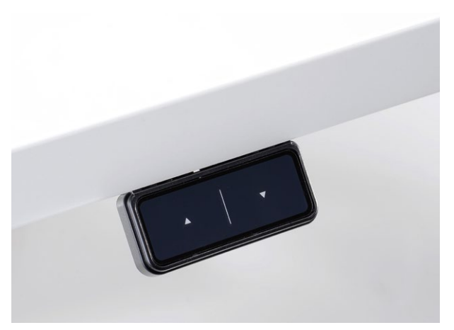
Hand switch Up-Down TOUCHbasic DN