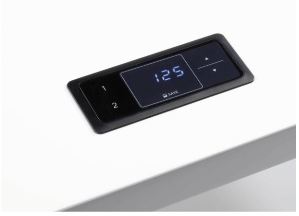
Hand switch Memory, Inlay TOUCHinlay