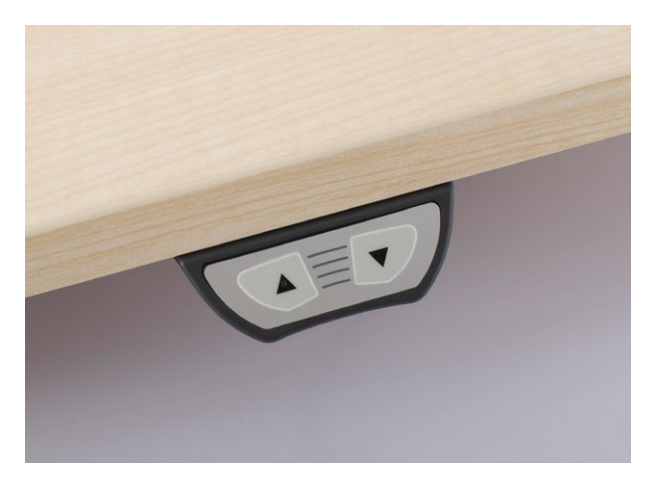
Hand switch Up-Down HSM-OD-2-LD

We provide solutions for an installation below the table and within the table top. From a simple hand switch with Up/Down function to a comfort switch with four memory functions and display – all operational elements convince through their surface design and the pleasing haptics.