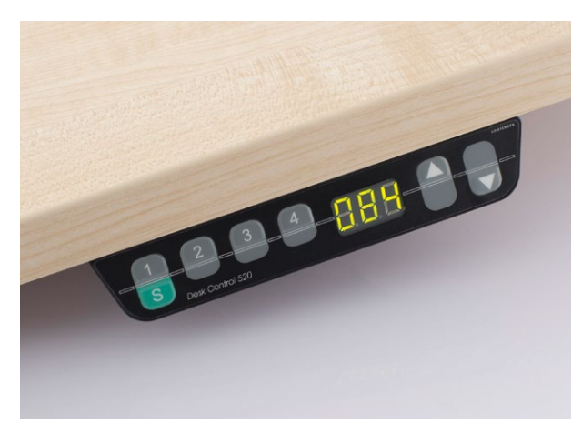
Hand switch Memory HSU-MDF-4M2-LD