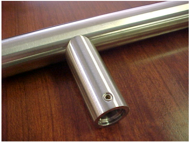
Fig. 1 Fig. 2

For a Normal Installation (attached with a machine screw through back - see Fig 3.), a Exterior type should be ordered with DKIT-1/30 or DKIT-2/30 depending on the material the handle is being mounted on.