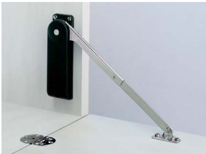
Combination of HDS-10 lid support (P.504).