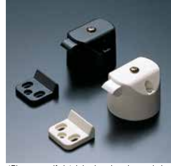
*Please specify latch body color when ordering. *Available in white (WHT) or black (BLK). *Latch body and push knob sold separately.