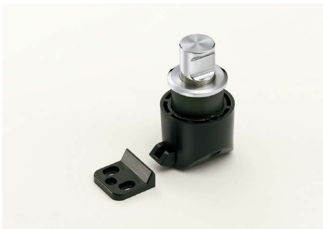
Knob (Pushed in)