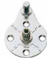
Mounting Plate SDS-A