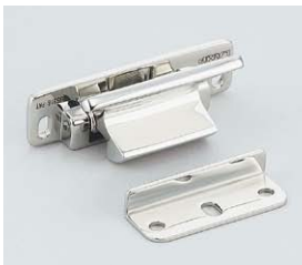
Stainless Steel Lever Latch LL-66S