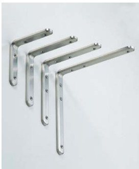
Angle Bracket XL-SA01