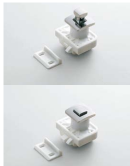
Push Knob Latch TLP-S

Can be used as falling prevention metal fittings for fixing cabinet or shelf to wall.