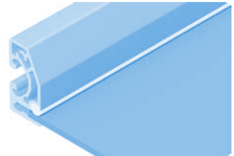
Dichtschnur Sealing Cord