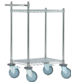
Mobile Beverages Rack