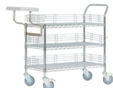
Super Multi-Purpose Trolley