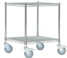
Mobile Equipment Rack