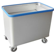
FB 180 G3