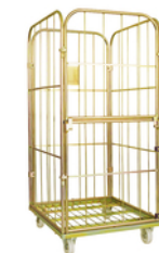
Roll Container M-XXL