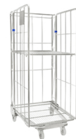
Roll Container Classic