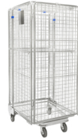
Roll Container SAFE