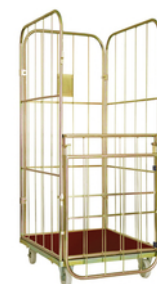
Roll Container S-XL