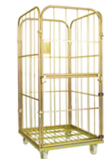
Roll Container M-XXL