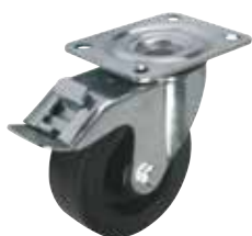
swivel head bearing

Wheel axle bolted. Wheels are shock and impact proof.