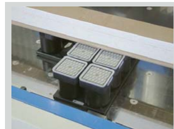
Clamping of a narrow workpiece with a quadruple suction block Quad-Base-T.